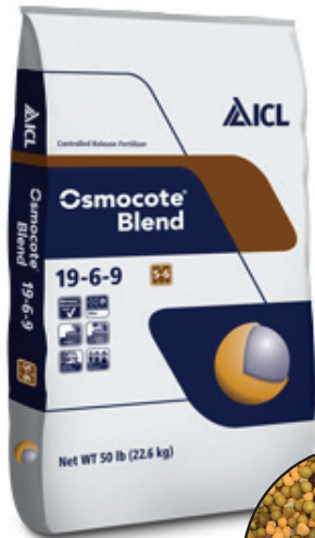
SKU - A99401C Packaging - 50 lb