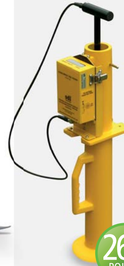
Clegg Hammer Football