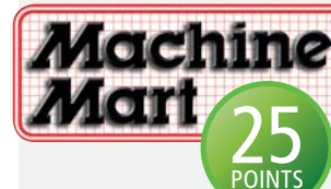
£150 Machine Mart Vouchers