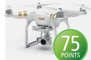
DJI Phantom 3 SE