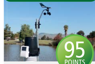
Davis Vantage Pro2 Weather Station