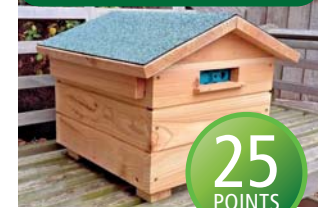
Beepol Hive and Villa