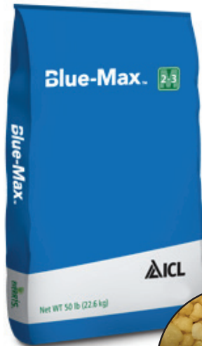
SKU - A901900 Packaging - 50 lb